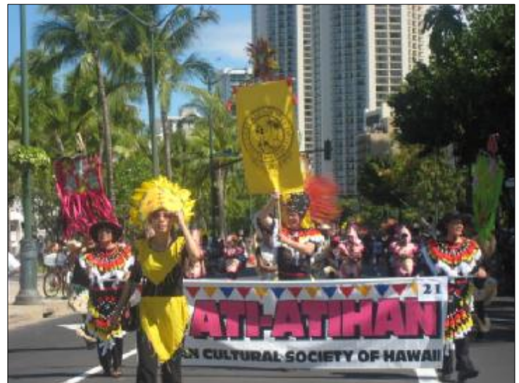
Parade participants from 2009

Filipino Fiesta and Parade has earned a reputation as the flagship event for Hawai'i's Filipino community. It's a great opportunity to introduce residents and visitors to the Filipino culture and the all-day affair also provides an opportunity for Hawai'i-born Filipinos, especially the younger generation, to learn more about themselves and their heritage.